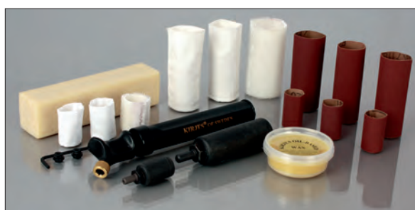
Detailed Sanding & Polishing Kit Art. no. KJ120130P Hand pump, Inflatable drums KJ120 and KJ130, 6 Sanding Sleeves, 6 Cloth Sleeves, Cleaner, Non-toxic Organic Wax.