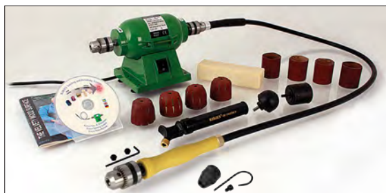
Basic Sanding System Art. no. KJ140K-230 Basic Sanding Kit, Motor, Flexible Shaft, Booklet and DVD.