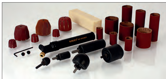
Total Sanding Kit Art. no. KJ101 Hand pump, all 5 Inflatable drums, 15 Sanding Sleeves, Cleaner.