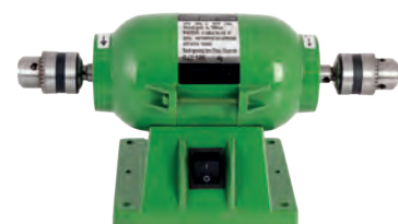
Motor. Art. no. KJ913K-230

Technical info: 300 W, 3000 rpm, extremely quiet. Height: 150 mm. Total length: 300 mm. Weight: 4,5 kg. With two tapered key-chucks = vibration-free running. Chucks: 1,5-10 mm.