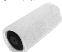
(B) Sleeve to KJ130