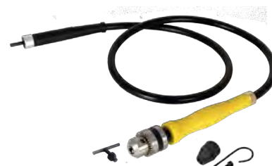
Flexible Shaft. Art. no. KJ202S