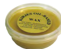
Oil-Wax 50ml KJ907