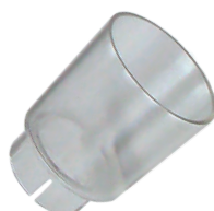
Dust Extensor. Art. no. KJ219