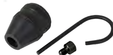
Small Chuck 1,5-8 mm. Art. no. KJ203

Dust Extractor with Extensor, enable dustfree woodworking. The transparent Extensor can be formed according to need. Small Chuck, 1,5-8 mm, is included in KIRJES Flexible Shaft. The smaller overall size makes the work easier.