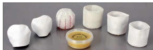
Polishing Kit Art. no. KJ908 2 Brush Sleeves and 4 Cloth Sleeves (fitting KJ140 and KJ140R), Non-toxic Organic Wax.