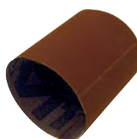
Sleeve to KJ140